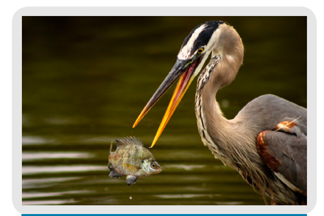
Heron (the Netherlands)

In this lesson you will learn more about plants and animals by asking different questions. About which of these animals do you want to know more?